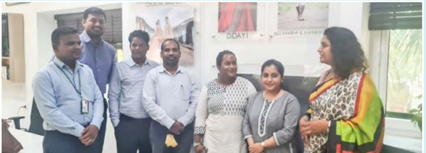
With Faculty of Centre for American Studies in KISS